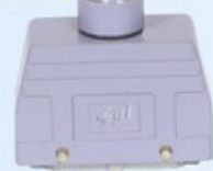
Top Entry Two Lever