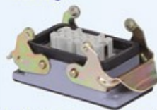
Open Bottom (Panel Mounting) Two Lever