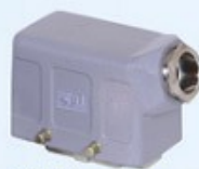
Side Entry Two Lever