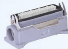
Close Bottom (Surface Mounting) Single Lever